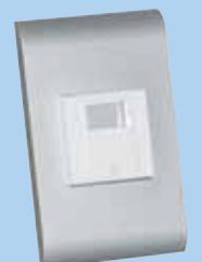
Programmable time switch