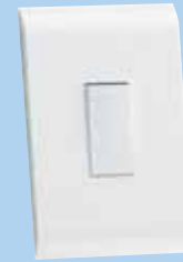
One lever switch