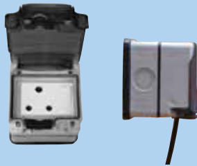
IP66 plug engaged