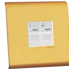
Phone and data sockets